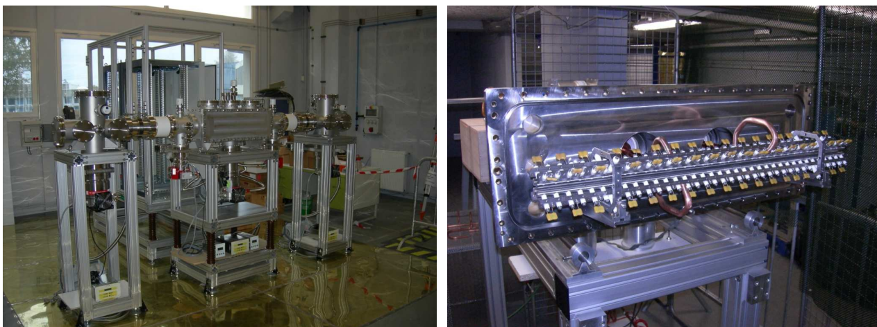
Photographs of the new SPIRAL2 High Intensity RFQ Cooler (SHIRAC2) prototype; (left) the insulated housing, high voltage cage and differential pumping stages; (right) the segmented quadrupole electrode and RF backbone structure, mounted as a module.

version has been performed with the main elements already fabricated by the LPC mechanical engineering staff (see photos).